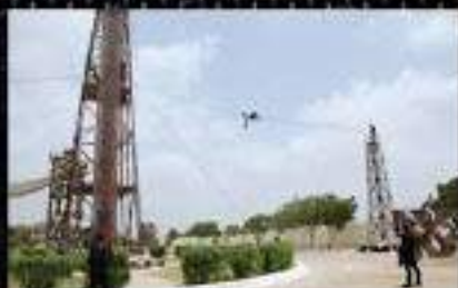
Trainee Commando displaying rope crossing during the demonstration.