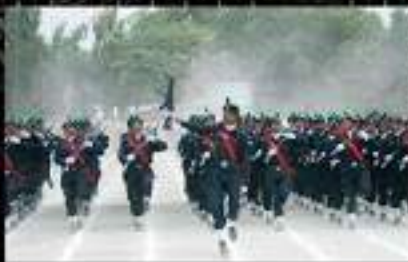
Commandant's squad marching during the parade.