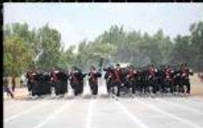
Commando's squad saluting while passing by saluting base.