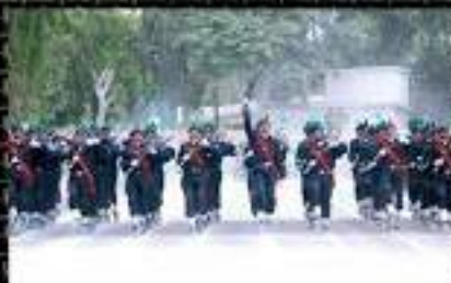
Cobrasters' squad marching during the parade.