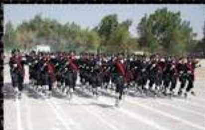
Passing out trainees saluting while passing by saluting base.