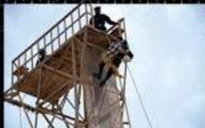
Commando rescuing an injured person during demonstration.