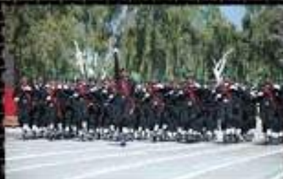
Commandant's squad marching towards the saluting base.