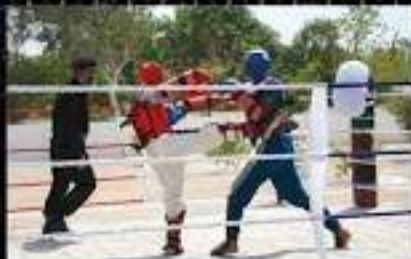
Trainee commandos displaying kick boxing skills during the demonstration.