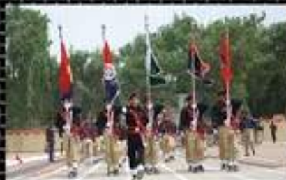
Passing out parade marching towards the saluting base.