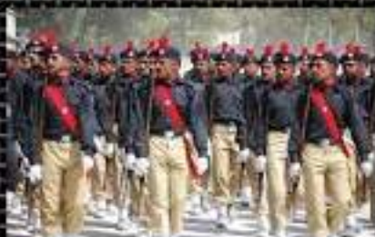
Passing out trainees saluting while passing by saluting base.