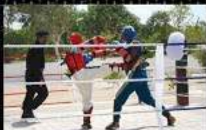
Trainee commands displaying kick boxing skills during the demonstration.