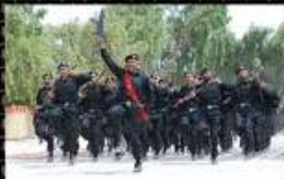
Commandant's squad marching towards the saluting base.