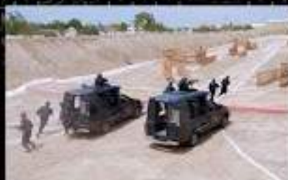
Commandos responding to a threat during demonstration.